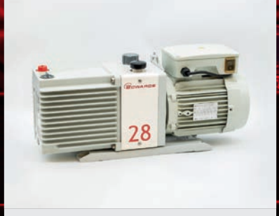
Edwards E2M28 Rough Pump