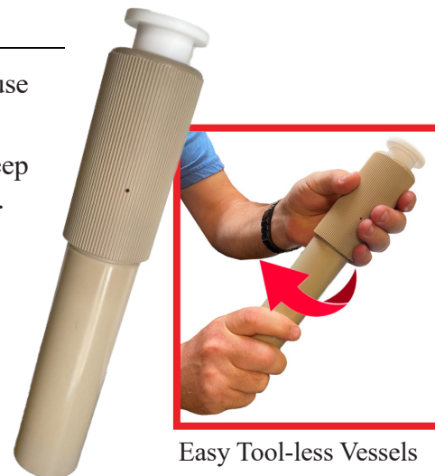
Easy Tool-less Vessels

Audible Anomaly Detection System will notify the user with alarm in case of vessel rupture.